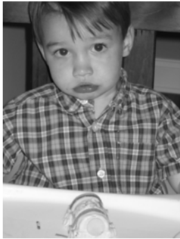
Look who's 2!

Volume IV, Issue 31 May 1, 2008 Seneca, SC