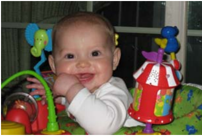
Every Day Is A 3 Ring Circus... hop aboard.

Here's free advice if you're buying or refinancing your home. It's my free report titled, "7 Secrets For Saving Thousands When Financing Your Home." See my website to get a free copy.