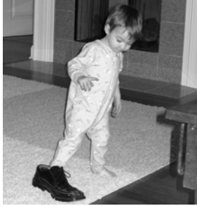
When I grow up... I'm going to be just like my dad!

Volume IV, Issue 30 April 1, 2008 Seneca, SC